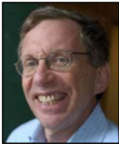
Professor Jerry Hausman

The Perth Conference Scientific Committee recently announced that the keynote address will be delivered by Professor Jerry Hausman, the John and Jennie S. MacDonald Professor of Economics at the Massachusetts Institute of Technology (MIT).